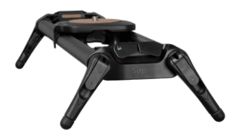
Available sizes: 60cm (23,6in), 1m (39,4in) and 1,6m (63in) tracks.